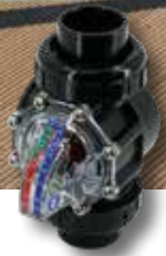
FlowVis® FV-15-U for 1.5" pipe (Unions)