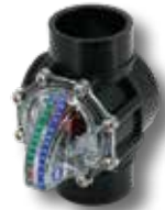
FlowVis® FV-25 for 2.5" pipe