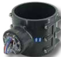
FlowVis® FV-8 for 8" pipe