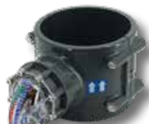
FlowVis® FV-6 for 6" pipe