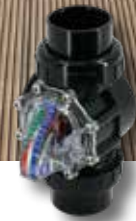
FlowVis® FV-2-U for 2" pipe (Unions)