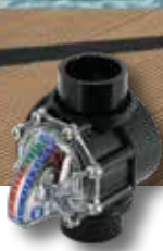
FlowVis® FV-15 for 1.5" pipe