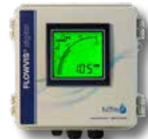
FlowVis® Digital FV-D