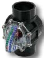
FlowVis® FV-C-S for 2" pipe (no check valve)