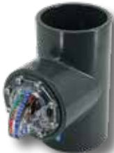
FlowVis® FV-4 for 4" pipe