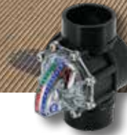
FlowVis® FV-2 for 2" pipe