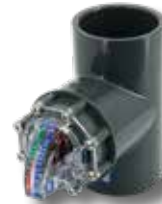
FlowVis® FV-3 for 3" pipe