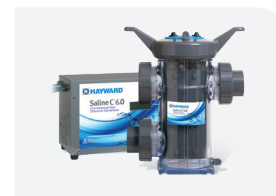
SALINE C® SYSTEM

*For international version and part number information, please contact your local Hayward® Sales Representative