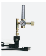
CO 2 FEEDER