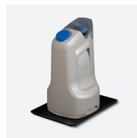
pH/Cl CHEMICAL FEED SYSTEMS