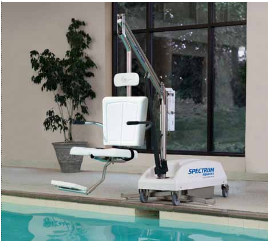
PORTABLE POOL LIFTS