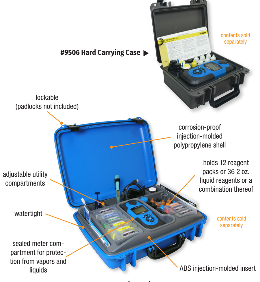
▲ #9504 Hard Carrying Case

Heavy-duty 600 denier polyester, sized to accommodate the rigid foam insert the M-2000 ships in.