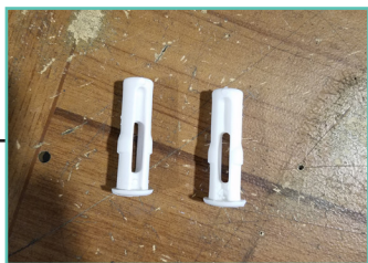
Pin USSP0096 & USSP0097