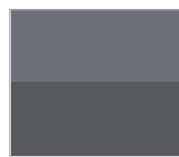
Titanium Gray/ Charcoal