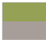
Cactus Green/ Linen