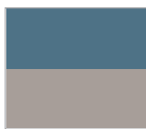
Storm Blue/ Linen