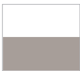
Glacier White/ Linen